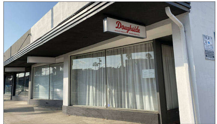
Doughside Donuts is moving in at 417 South Coast Hwy. in downtown Oceanside.