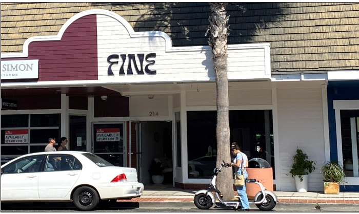
Fine , a gift and souvenir shop recently opened at 214 North Coast Hwy. in Downtown Oceanside.