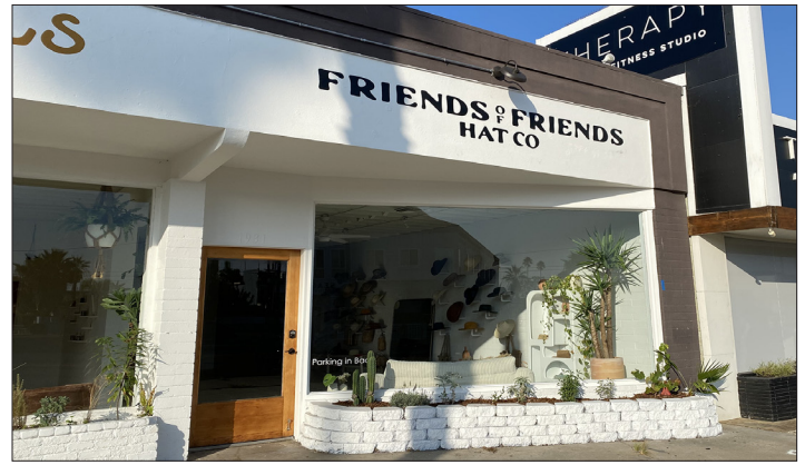
Friends of Friends Hat Co. recently opened their flagship store at 1931 South Coast Hwy. in South Oceanside.