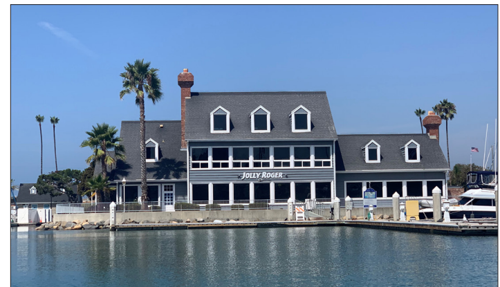
Trademark Venues - Cape House is coming soon to 1900 Harbor Dr. in the former Jolly Roger Restaurant site.