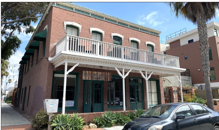
Coming soon, "The Bunker House" is under new ownership by the O'side Bakery and serving their bakery items, breakfast, and brunch.