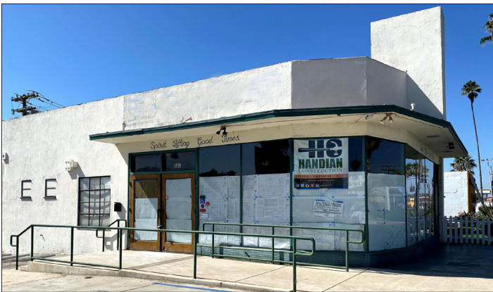
Beer Town is coming soon to downtown Oceanside at 507 North Coast Hwy