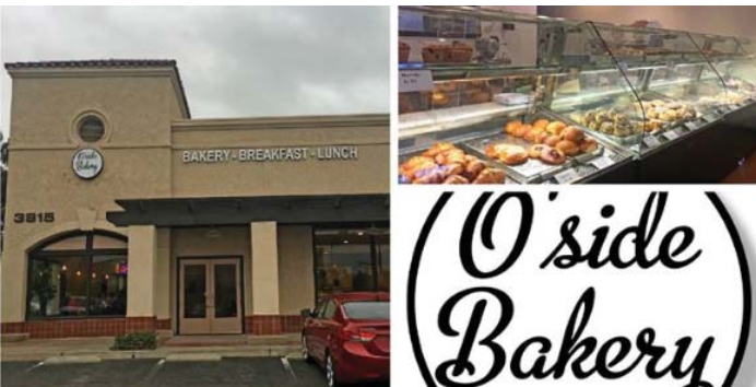
O'side Bakery is now open at 3815 Mission Ave. in the Mission Plaza Real shopping center. O'side Bakery serves breakfast and lunch, along with patisseries, cakes and baked goods.