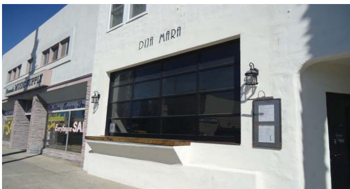
Dija Mara is now open at 232 South Coast Hwy. in downtown Oceanside. Dija Mara features Balinese-inspired cuisine.