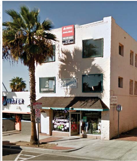
JEANETTE'S CLEANERS 2014