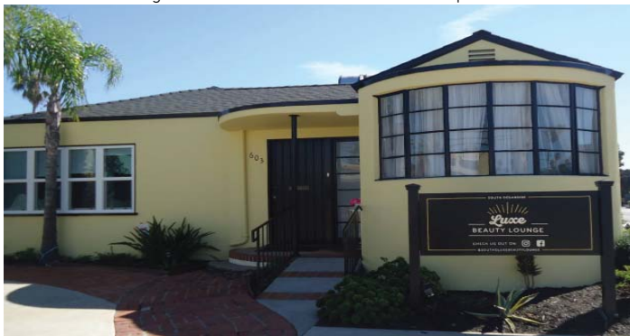
South O Luxe Beauty Lounge opened at 603 Vista Way in South Oceanside. www.southluxebeautylounge.com