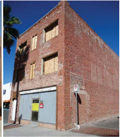
TODAY WITH BRICK EXPOSED

408 PIER VIEW WAY is getting a second life. Once known as The Schuyler Building, built in 1888, it was a prominent fixture in the early days of Oceanside. This building helped pave way for the growth we see today. Many changes have occurred throughout the years, such as being converted to a 3-story building, and various businesses like a hardware store, grocery store and dry cleaner. The 100+ year old building's brick exterior was covered in stucco for many years until it was recently purchased with a plan to restore the building back to its original charm to make way for a boutique hotel with a restaurant.