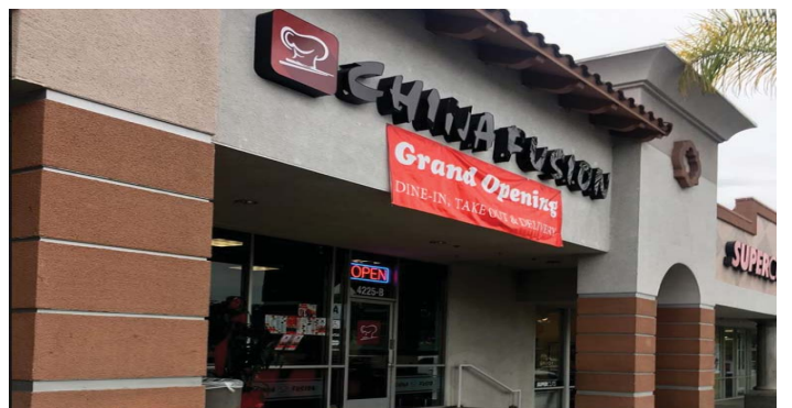
China Fusion is now open at 4225 Oceanside Blvd., Ste B in the Rancho del Oro Gateway shopping center.