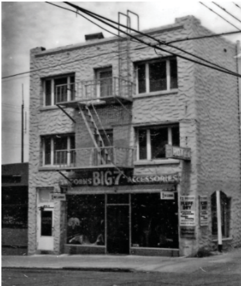
AVON HOTEL 1967