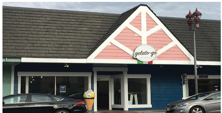
Gelato-Go is now open at 212 North Coast Hwy. in Downtown Oceanside.