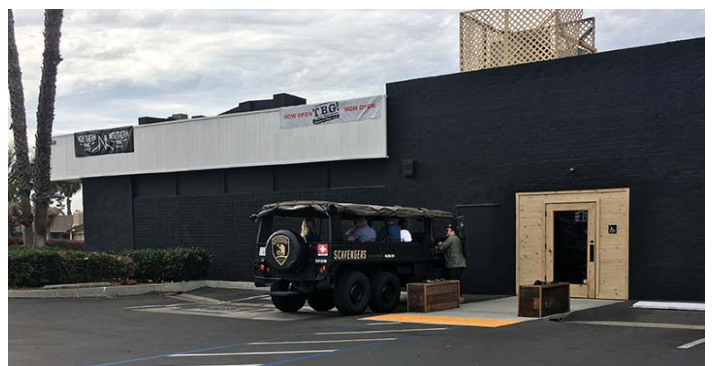
Northern Pine Brewery and That Boy Good BBQ Joint are now open at 326 North Horne St.