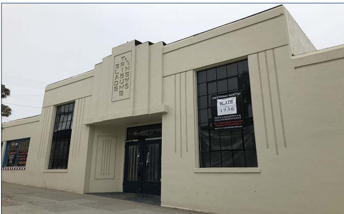
Coming this fall “ Blade 1936 ” a modern Italian eatery will be located at 401 Seagaze in downtown Oceanside. This restaurant's name is a tribute to The Blade-Tribune, a local newspaper that resided in the building from 1936 until the 1960s. This historic building was architect Irving Gill's last project and is being revived by local architect Kenneth Chriss.