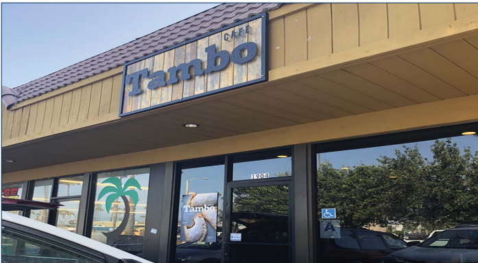
Tambo Cafe is now open at 1904 South Coast Hwy. Tambo offers Peruvian delights such as tamales, “sanguches” (sandwiches), pastries and drinks.