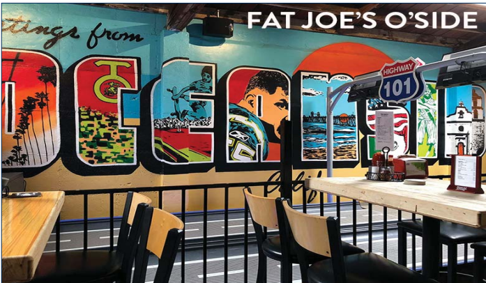
Fat Joe's O'side is now open at 424 S Coast Hwy. Fat Joe's is a family friendly restaurant and arcade that serves burgers, pizza, wings to name a few. They have classic 80's arcade video games, pinball machines, air hockey and a two lane mini bowling lanes.