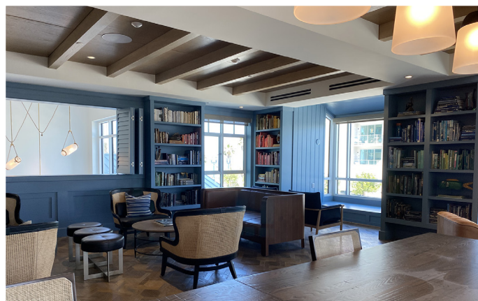
Jim Wood Library